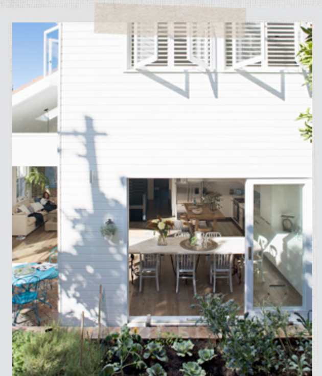
A gorgeous garden is within easy reach of the kitchen, while a courtyard of recycled bricks makes a lovely sunny sitting spot.

"They have their own unique styles, and they certainly like to ask and learn. I try to teach them about not wasting – buying second-hand, recycling, using things we have and not replacing them just for the sake of it."